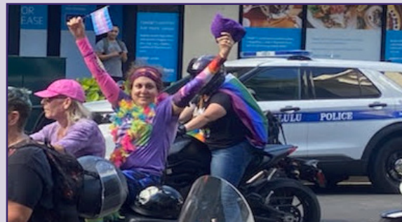
Above: Scenes from Honolulu Pride 2022.